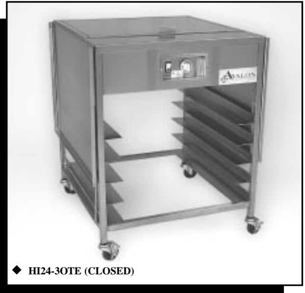
◆ HI24-30TE (CLOSED)