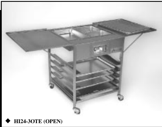
◆ HI24-30TE (OPEN)

Our Hot Icing Conditioners come in a wide variety of sizes and configurations. You can order these units to meet your own specifications. All models are constructed of #304 stainless steel. Temperature controlled water jacket eliminates hot spots and prevents icing breakdown. Pictured are a few of our most popular styles.